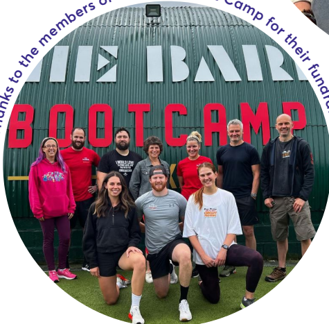
Thanks to the members of The Barn Boot Camp for their fundraising