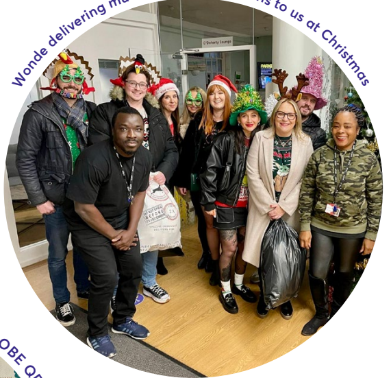
Wonde delivering much needed donations to us at Christmas