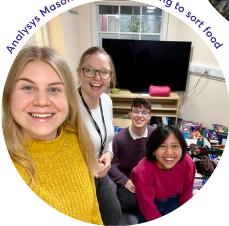
Analys Mason volunteers helping to sort food