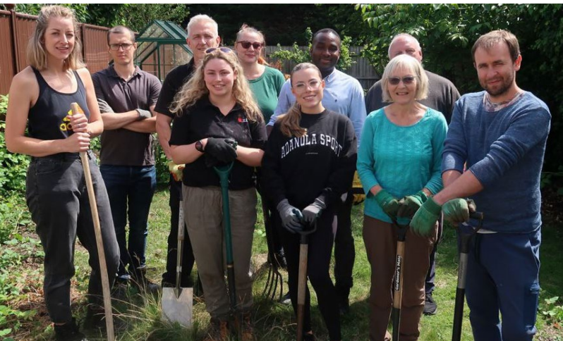
Sodexo volunteers helping at one of Jimmy's gardens