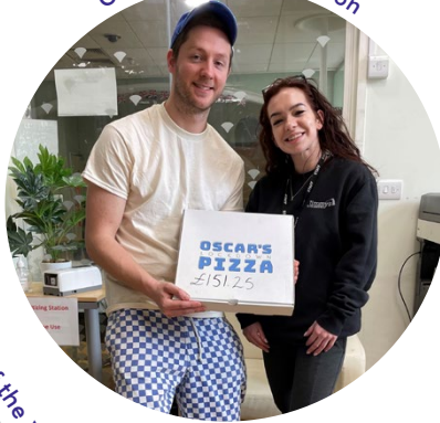
Oscar's Pizza's donation