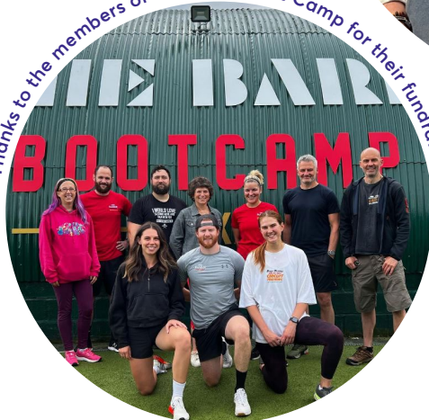
Thanks to the members of The Barn Boot Camp for their fundraising