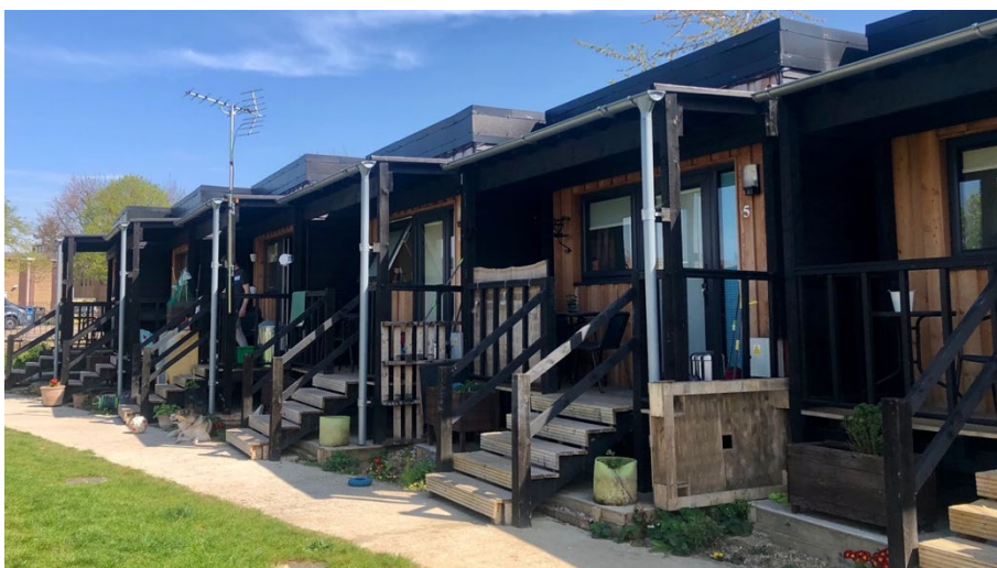
Figure 2- New Meaning Foundation units in Cambridge. Photo by: Katy Karampour, 2022