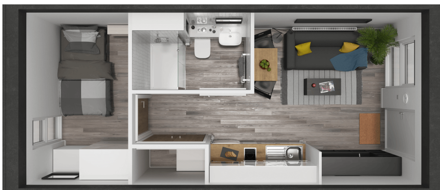
Figure 3- Floor plan of a SoloHaus unit.

The individual SoloHaus homes are stackable and moveable. The units are manufactured in 20 days; each home weighs approximately 9.5t and is delivered on a flat bed lorry and lifted into location. Hill's units provide 24 square metres of living space and heated with an air source heat pump (SoloHaus, n.d.).