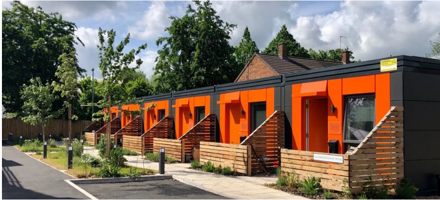
Figure 4- SoloHaus units in Cambridge.