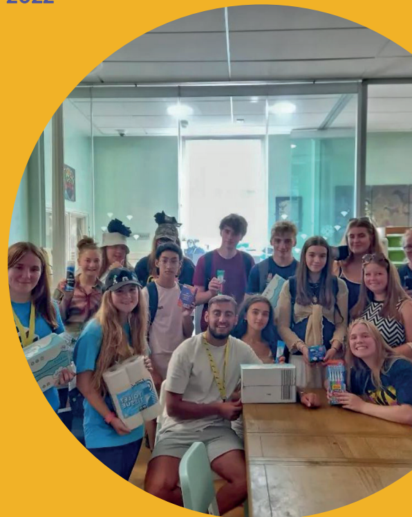
↑ Group of students collecting items for Jimmy's as part of their National Citizenship Service