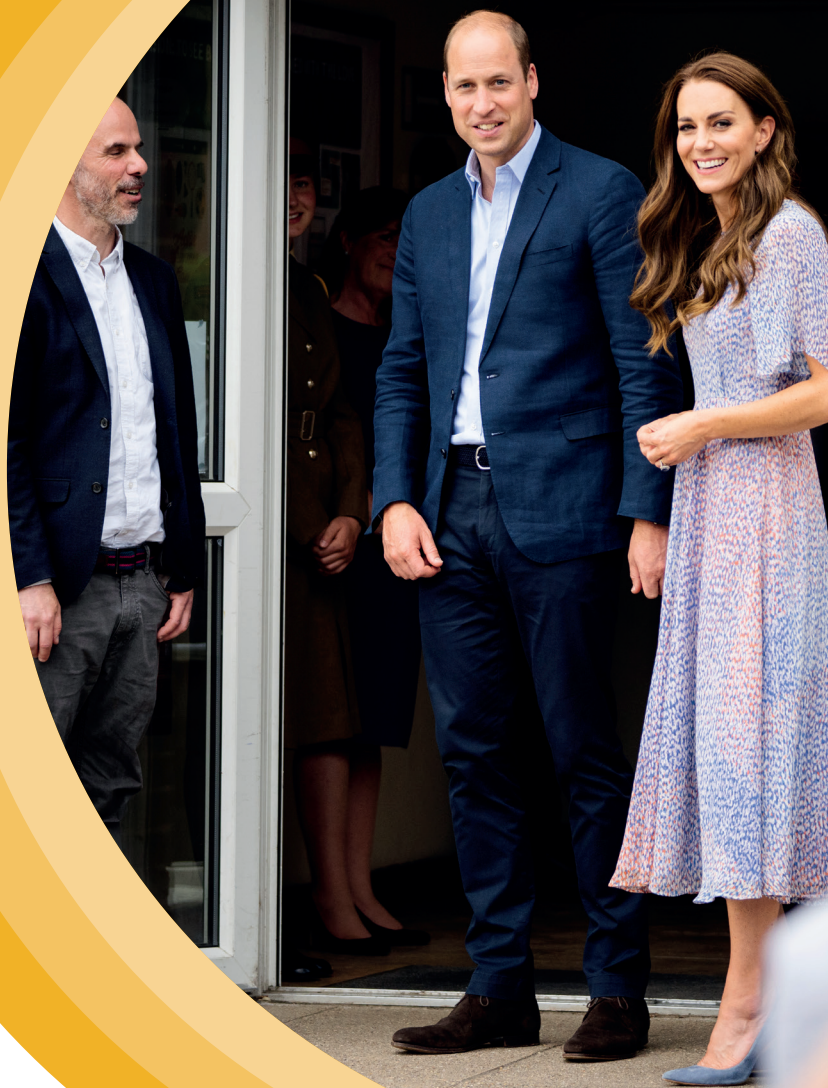
↑ Duke and Duchess of Cambridge visit Jimmy's Modular Homes – June 2022

“Jimmy’s gave me the support to get me back on my feet, time to think and warm up”