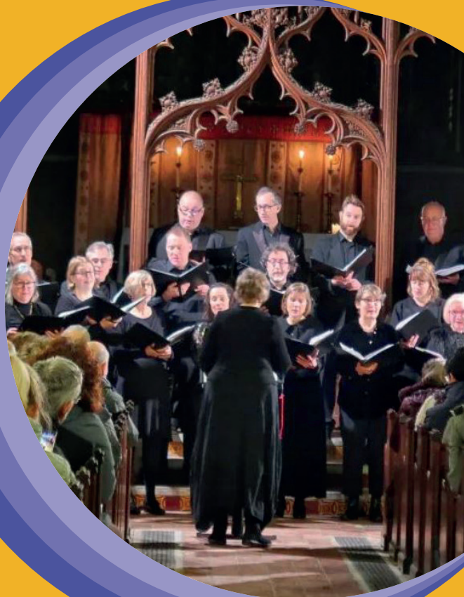
↑ Granta Chorale raise funds for Jimmy's at their annual Christmas Concert – December 2022