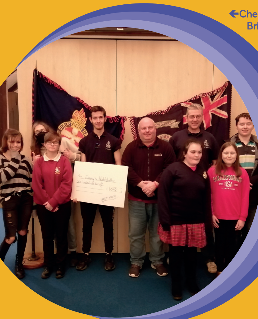
← Cheque presentation from the 1st Sawston Brigade, who did a sleep out for Jimmy's – February 2022