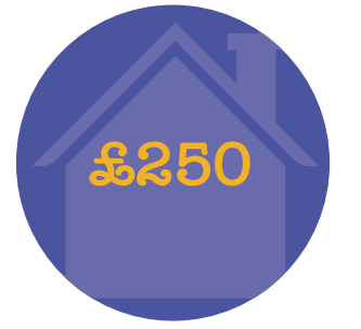
could employ a Mental Health support worker to run four sessions with residents, tackling their individual issues